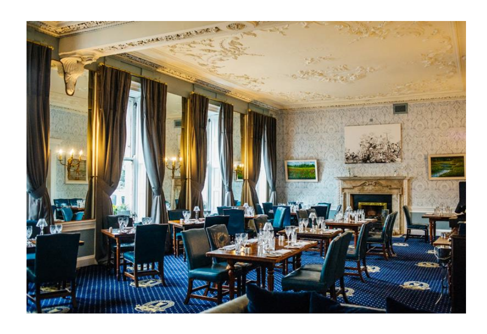
SATURDAY OCTOBER 20, 2018